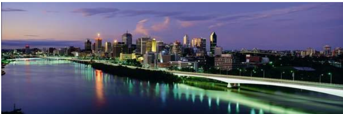
Brisbane River at Dusk