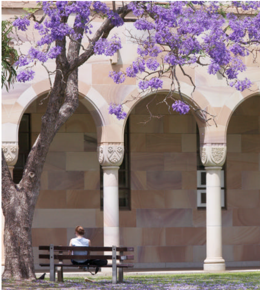
University of Queensland, St Lucia campus

Specific dates for the Conference have not, as yet, been set as the dates for other meeting with which we would not wish to conflict have thus far not been published. However, the venue is available from the 6 th of July to the 17 th of July.