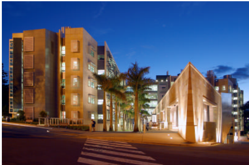
IMB Building, University of Queensland

The University of Queensland is one of Australia's leading research universities, employing around 4800 staff and with student enrolments of around 33,000, including almost 8000 postgraduates. The University is consistently amongst the top four Australian universities in attracting competitive research funding. Queensland has particular strengths in the biological sciences. The Institute for Molecular Bioscience (IMB) houses around 400 research staff and research students in a purpose-built, state-of-the-art facility and has an annual budget in the order of $35m. Other strengths include ecology and marine biology.