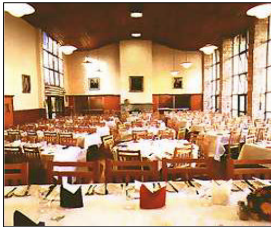
Emmanuel College dining hall

It is envisaged that delegates will liaise directly with Emmanuel College, in the first instance via a link on the Conference website, to coordinate their accommodation requirements. Emmanuel College is currently installing an automated on-line booking service which should ensure a smooth process. The College provides for a range of payment options including all major credit cards and bank transfers. A one off booking of fee of $10 per guest is payable to the College.