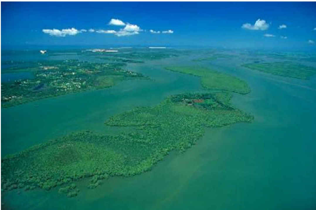
View of Moreton Bay

The ETA is a stored electronic authority for travel to Australia for the short-term tourist. It replaces the passport visa label or stamp in a passport and removes the need for application forms. ETA visas are issued within seconds of being requested through computer links between Department of Immigration, Migration and Indigenous Affairs, travel agents, airlines and specialist service providers around the world, ensuring delegates know their visas are in order before leaving their home country.