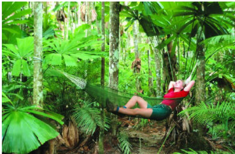
Relaxing in the Rainforest