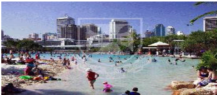
South Bank Beach

South Bank Parklands have a range of attractions and entertainment taking advantage of Queensland's open-air lifestyle and balmy weather. Activities can range from swimming at the city beach, exploring one of the world's largest collections of Aboriginal and Asian art, relaxing in fine restaurants and alfresco cafes, enjoying sophisticated and stylish shopping in the many nearby boutiques and specialty shops or sharing in the fun and festive street markets.