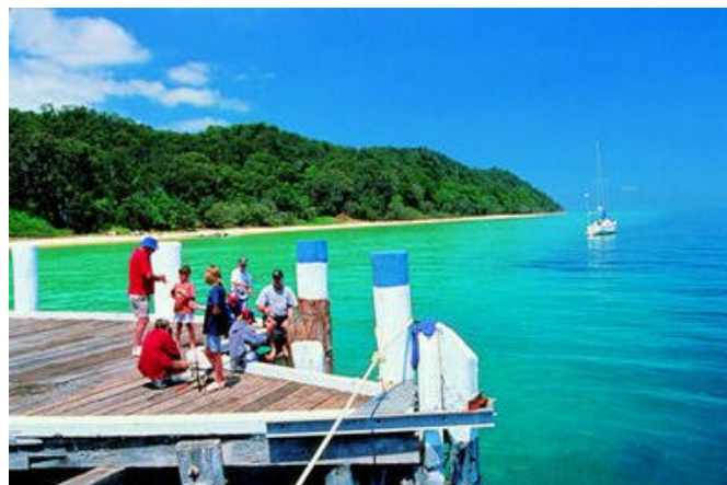
Fishing off the jetty