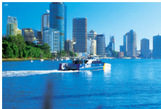
CityCat on Brisbane River

Brisbane's picturesque river setting provides a refreshing option for delegates. The high-speed ferries, CityCats , compliment the fleet of river ferries that regularly cross the Brisbane River connecting with the University campus at approximately 20 minute intervals.