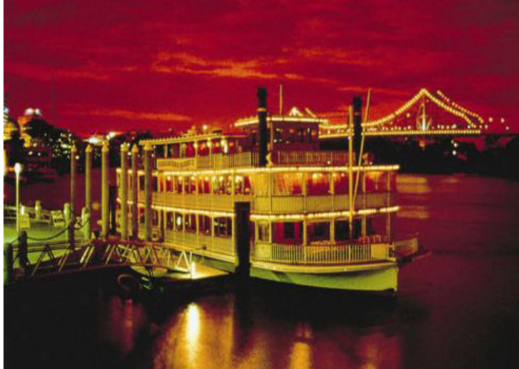
The Kookaburra Queen

The Kookaburra River Queen I and II are authentic paddlewheelers which can accommodate up to 700 dinner guests. The steamers depart from Eagle Street Pier in the centre of Brisbane City and cruise along the Brisbane River offering a unique dining experience. At current prices a cruise and dinner package would cost $85 per person.