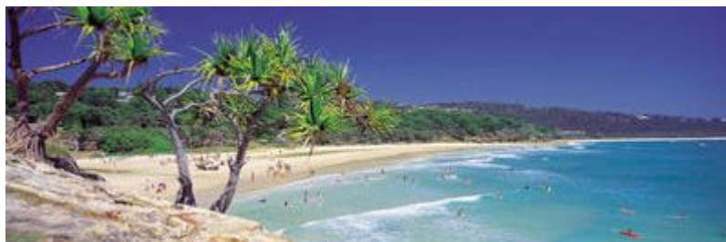
North Stradbroke Island