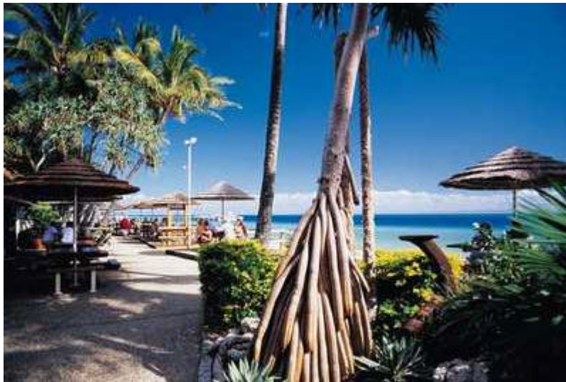
Outdoor dining at it's best at Tangalooma on Moreton Island!