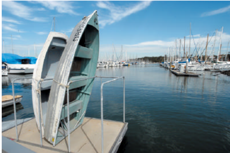
Sailing on Moreton Bay