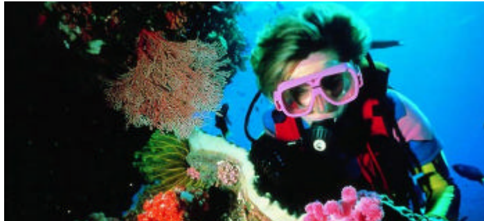
The Great Barrier Reef – Far North Queensland