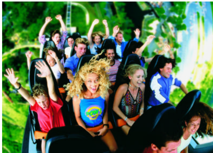
The Tower of Terror – Dreamworld