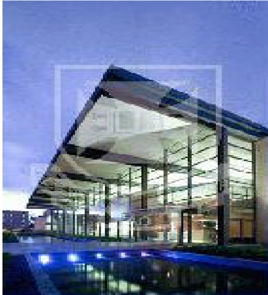
The Mayne Centre

The Mayne Centre, adjacent to the Great Court, houses the University of Queensland's extensive art collection. The Centre offers a sophisticated location for a welcome cocktail reception for delegates. At current prices a 2 hour reception including alcohol and food would cost in the region of $20 per person.